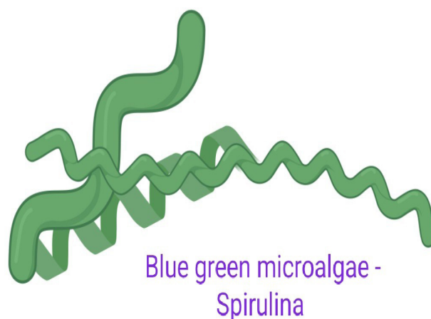
Figure 1: Spirulina Microalgae under Microscope.

Spirulina also exhibits neuroprotective effects; in rats, it boosted post-stroke locomotor activity and markedly decreased the extent of cerebral cortical infarction. Spirulina supplementation over an