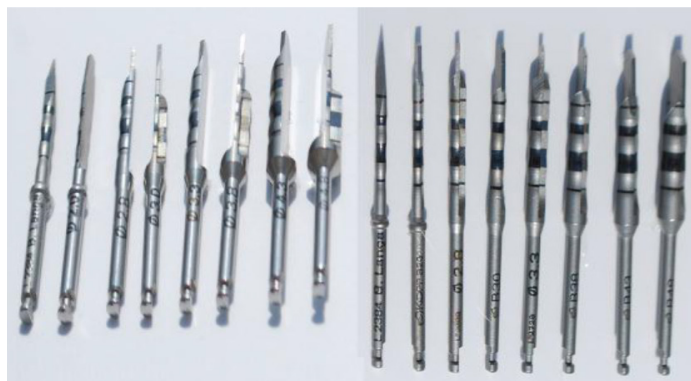
Figure 1: Conventional and experimental drill designs, respectively. Left: Conventional drills; Right: Experimental drills.

When evaluating the mean temperature values at 1 mm depth in the different protocols (with and without irrigation), the mean temperature value in G1 was 25.95 \pm 0.46^\circ\text{C} . Maintaining the same previous characteristics except only changing the experimental drills (G2), the mean value was 25.22 \pm 0.44^\circ\text{C} . Furthermore, the mean value in G3 was 21.01 \pm 0.52^\circ\text{C} and in G4 the mean value was 19.79 \pm 0.48^\circ\text{C} . When evaluating the mean temperature values at 5 mm depth in the different protocols (without and with irrigation), the mean temperature value in G1 was 30.59 \pm 0.47^\circ\text{C} . Maintaining the same previous characteristics except only changing the experimental drills (G2), the mean value was 29.74 \pm 0.41^\circ\text{C} . In G3 the mean value was 27.27 \pm 0.39^\circ\text{C} and in G4 the mean value was 24.91 \pm 0.42^\circ\text{C} . There was no statistical difference between the groups.