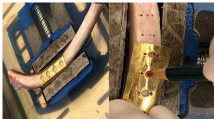
Figure 2: Adaptation of bovine bone and marking of points to be pierced. Preparation of the model to simulate the surgical bed.