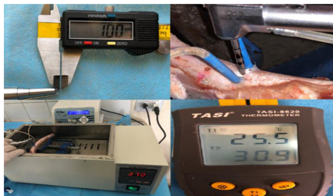
Figure 3: Calibration of the depths and adaptation of thermocouples; Sample immersed in thermostatic water box and temperature record (below). Thermocouples and preparation of the bones.